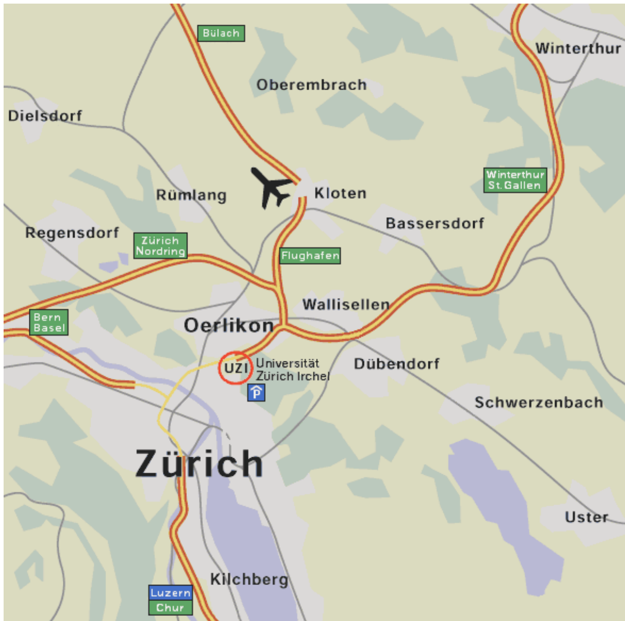
Map 1. Region of Zürich

Anthropological Institute University of Zürich-Irchel Winterthurerstrasse 190 CH-8057 Zürich