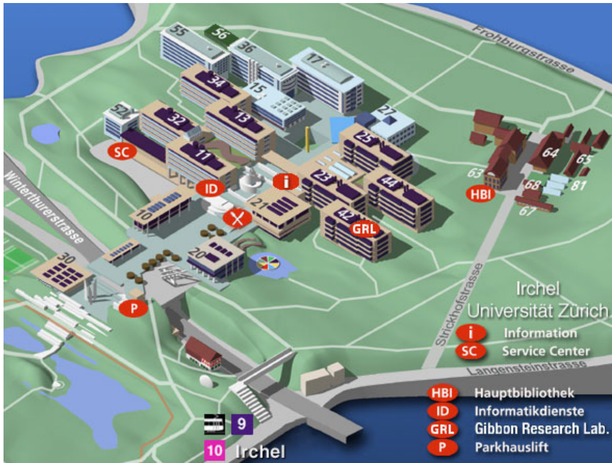
Map 4. Anthropological Institute and the Gibbon Research Lab. at the Irchel campus of Zürich University.

The Anthropological Institute is located in building 42, level K (see map 4). Thomas Geissmann's office is 42K74.