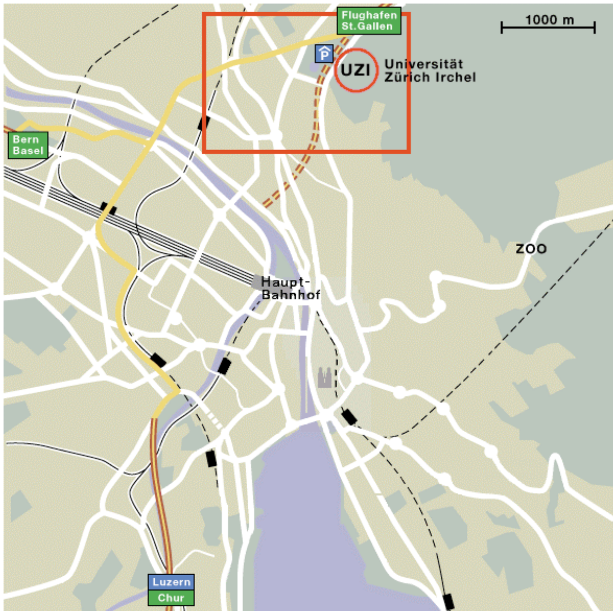
Map 2. Zürich City Map